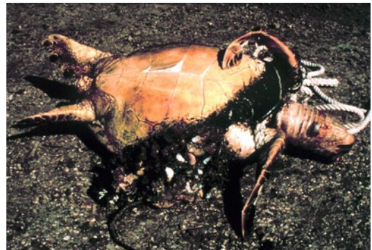
Several marine mammal, sea turtle, and bird species are in danger of extinction in large part from entanglements in fishing gear and other debris. This turtle was killed by boat debris.

If you've ever accidentally splashed a little gasoline on your hands when filling a car tank, you know that gas smell is pretty powerful and sticks around a long time. In fact, as little as one quart of oil or gasoline can contaminate up to 250,000 gallons of water. So here we have a dilemma—motors on powerboats need oil and